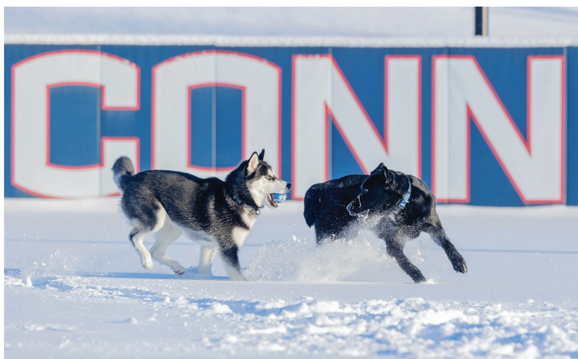
Jonathan XV’s previous fling.

In the meantime, UConn should prepare for any puppies that’ll come around, including Jonathan XVI.