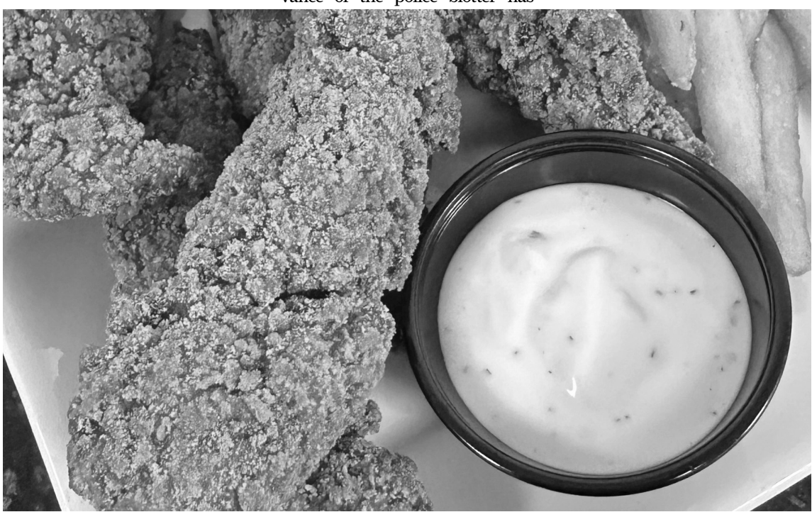
best halal and gluten free chicken out there.

me woozy," Napoleon Trotsky, a first-semester music and political science major, said. As a customer who had a staff member arrested, they were entitled to a free five-course meal. "I don't see why we're arresting these poor workers..." Worker Rights II, a second-semester individualized major in depressive studies, said. I felt so offended. My constitutional right to entertainment was being encroached. What a weird individual... Rights tried to incite a strike, but it was fate that the workers of The Coup stayed. "The Coup is my home and I shall be arrested because of it," Air Frier, a third-semester robotics engineering major, said. I want more Coups across the nation. Fuck it, worldwide. We need Coups everywhere, all at once, forever. Rating: 3.5/5