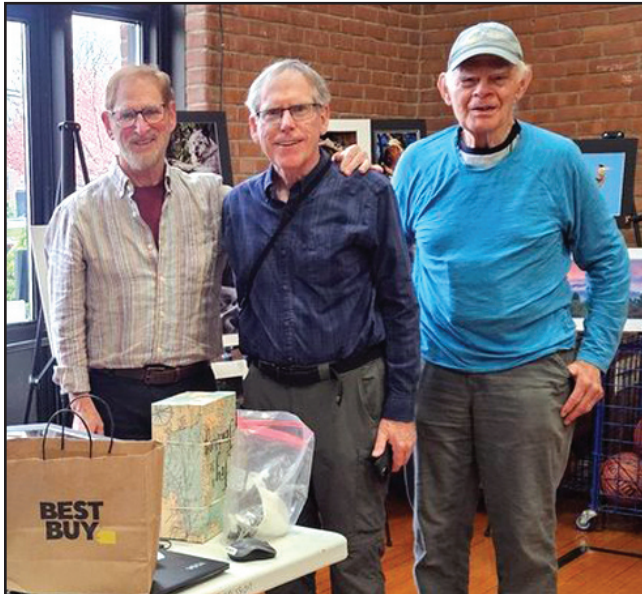
Pictured: Last years participants.