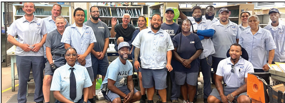
Pictured: Fellow USPS employees gathered in his honor.