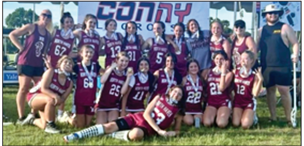
North Haven: Our Girls Senior 2 team came away with 3rd place at the CONNY tourney on Sunday! The team went 2-1 in pool play and defeated Norwalk 13-7 in the final game to take 3rd place! These girls battled the heat and back-to-back games!! Congratulauons Girls!!

WANTED: Collector buying any Connecticut Brewery items for Wehle, Hulls, Wiebel, Largay or any other CT Breweries, signs, cans, bottles, etc.; call (203) 915-7662