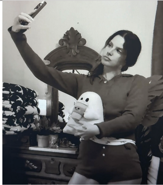
Lana Del Rey in her recent Instagram post promoting her new single "White Feather Hawk Tail Deer Hunter".