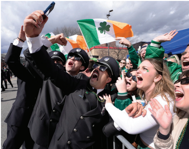
A Group of Firemen take a selfie with a group of Spectators at the annual St. Patrick's Day parade in Boston, Massachusetts.