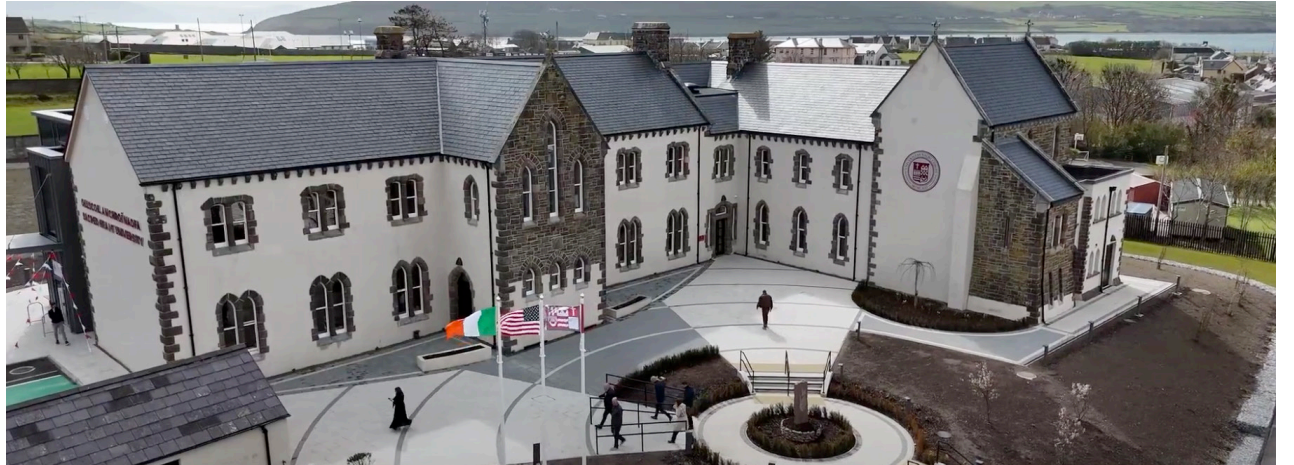
Sacred Heart University