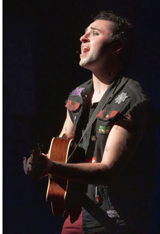
SHU Theatre Arts put on multiple performances of “American Idiot,” set to music by Green Day, from April 4-6, 2025.