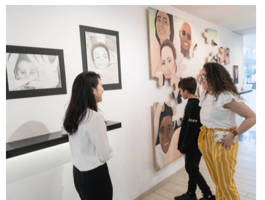
Sacred Heart University’s Art and Design Gallery hosted Senior Projects in 2019.