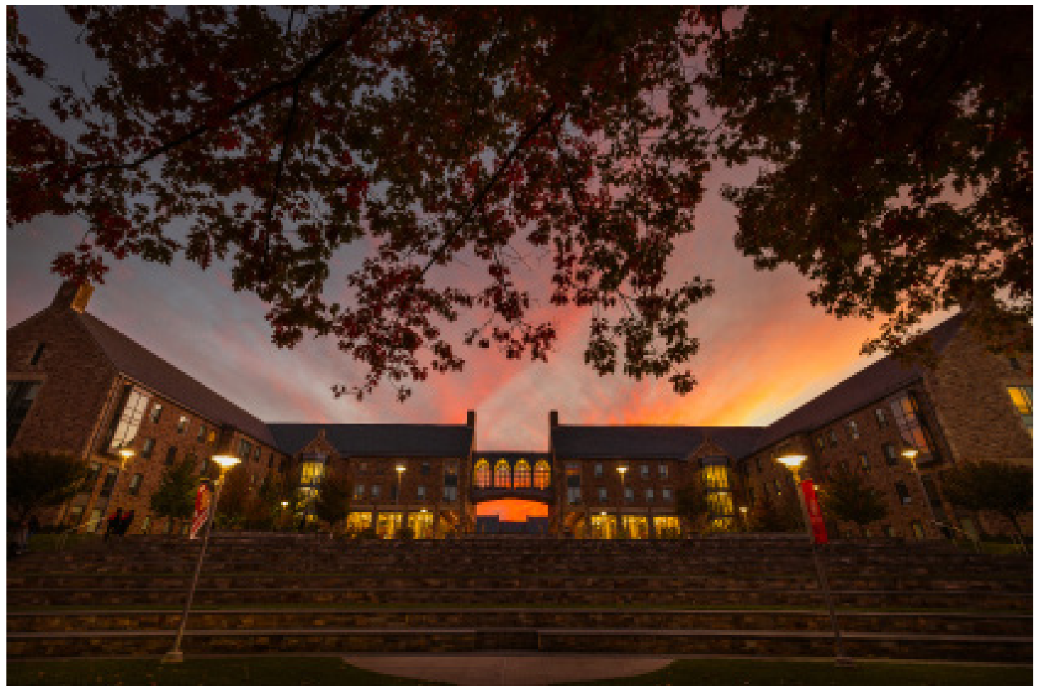
Campus imagery of the sunset over Pioneer Village.

I walk alone, in silence. Trapped somewhere between the serenity of the past and the wildness of tomorrow. Gentle with each step, so as not to leave a trace that would disturb the beauty of today.