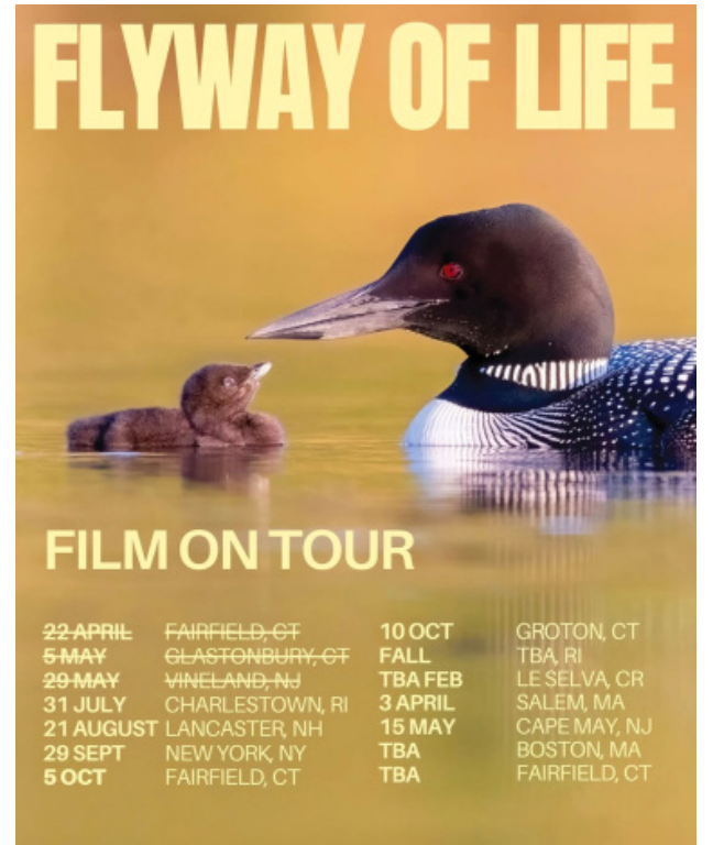
The documentary "Flyway of Life" is currently on tour across the Northeast, with screening dates listed for the upcoming months.

"Flyway of Life" premiered on April 22 at the SHU community theater in Fairfield, where the auditorium was packed for a sold-out viewing. Other screenings were held last