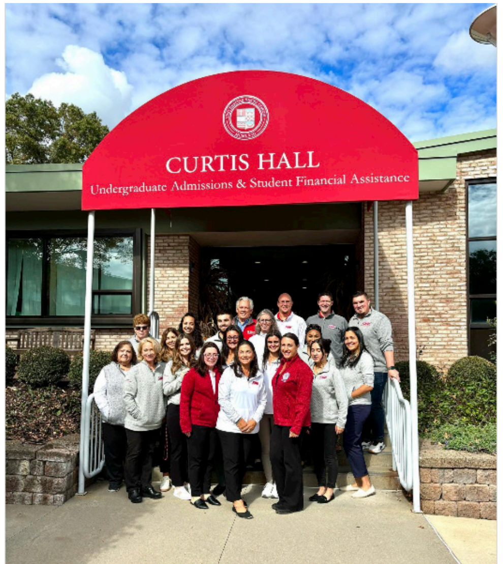
Curtis Hall staff celebrated National Financial Aid Day on Oct. 18, 2024.