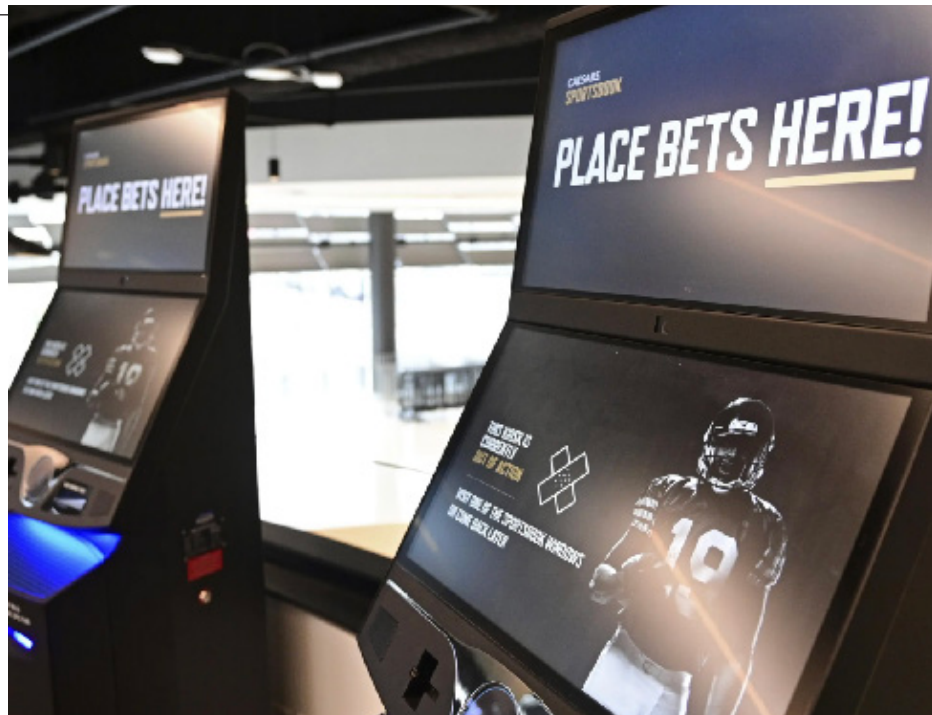
Betting kiosks are seen inside Caesars Sportsbook inside Rocket Mortgage FieldHouse, Thursday, Dec. 29, 2022, in Cleveland.