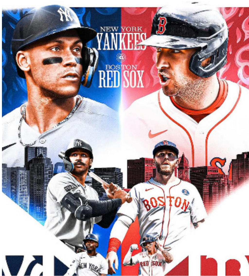
A graphic posted to Instagram highlighting the rivalry between the Boston Red Sox and New York Yankees this season.