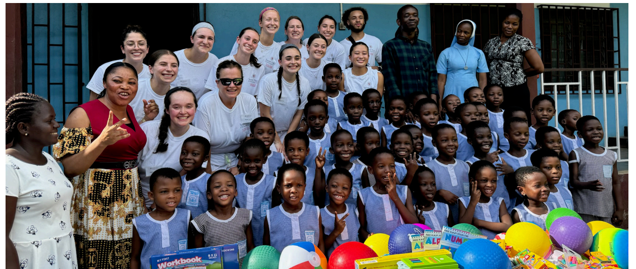
The nursing students and instructors with teachers and students from a Ghanaian school with the toys, games and coloring supplies that were being donated.