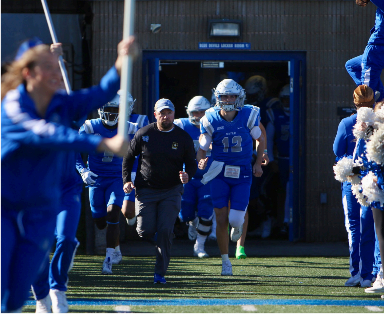
CCSU football team running out of the locker room