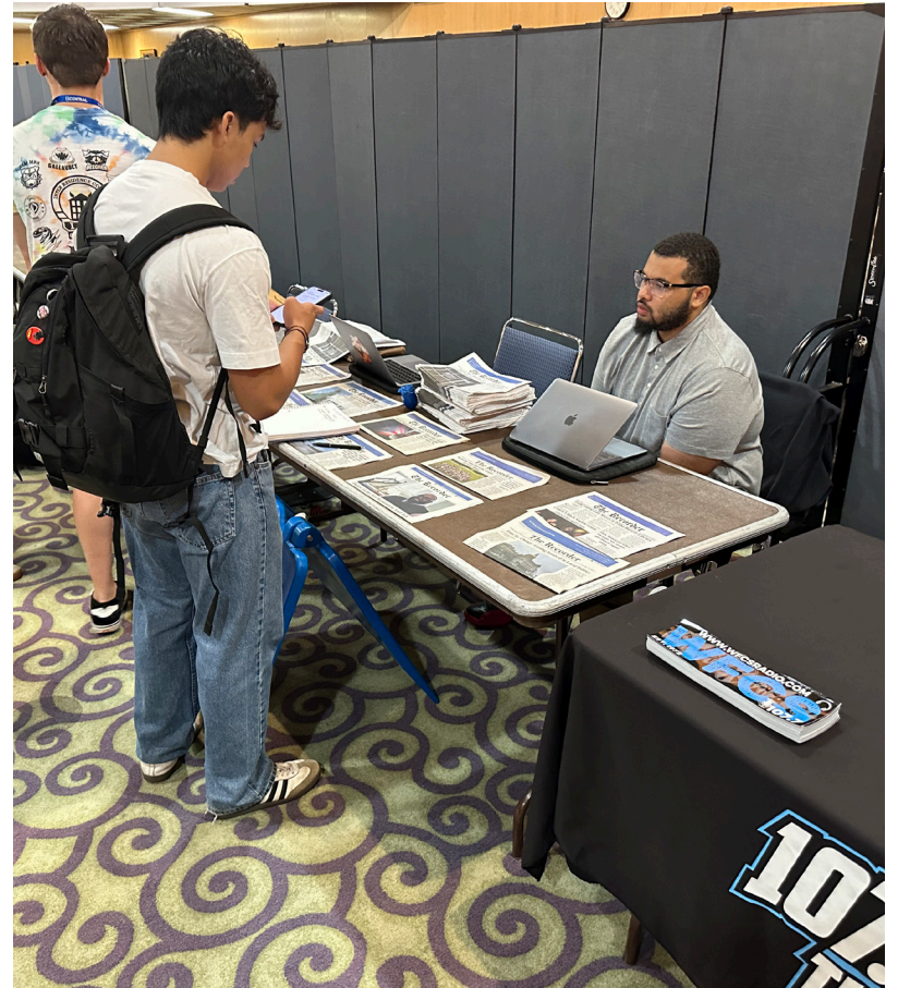
Recorder staff that graduated in the spring