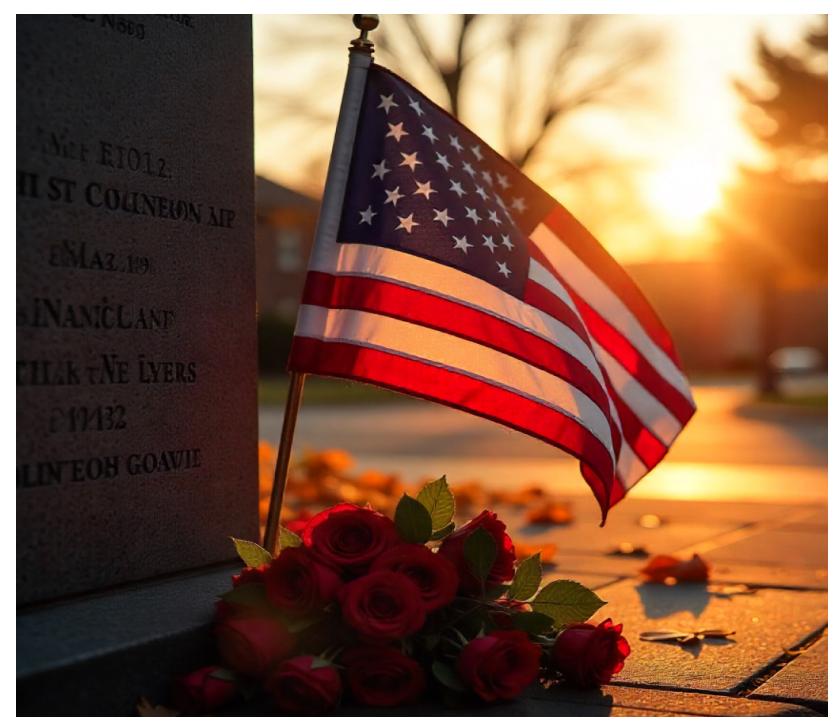
Photo Credit: Image included in Toro's 9/11 remembrance email. Note the illegible text on the tombstone and incorrect number of stars/stripes on the flag.