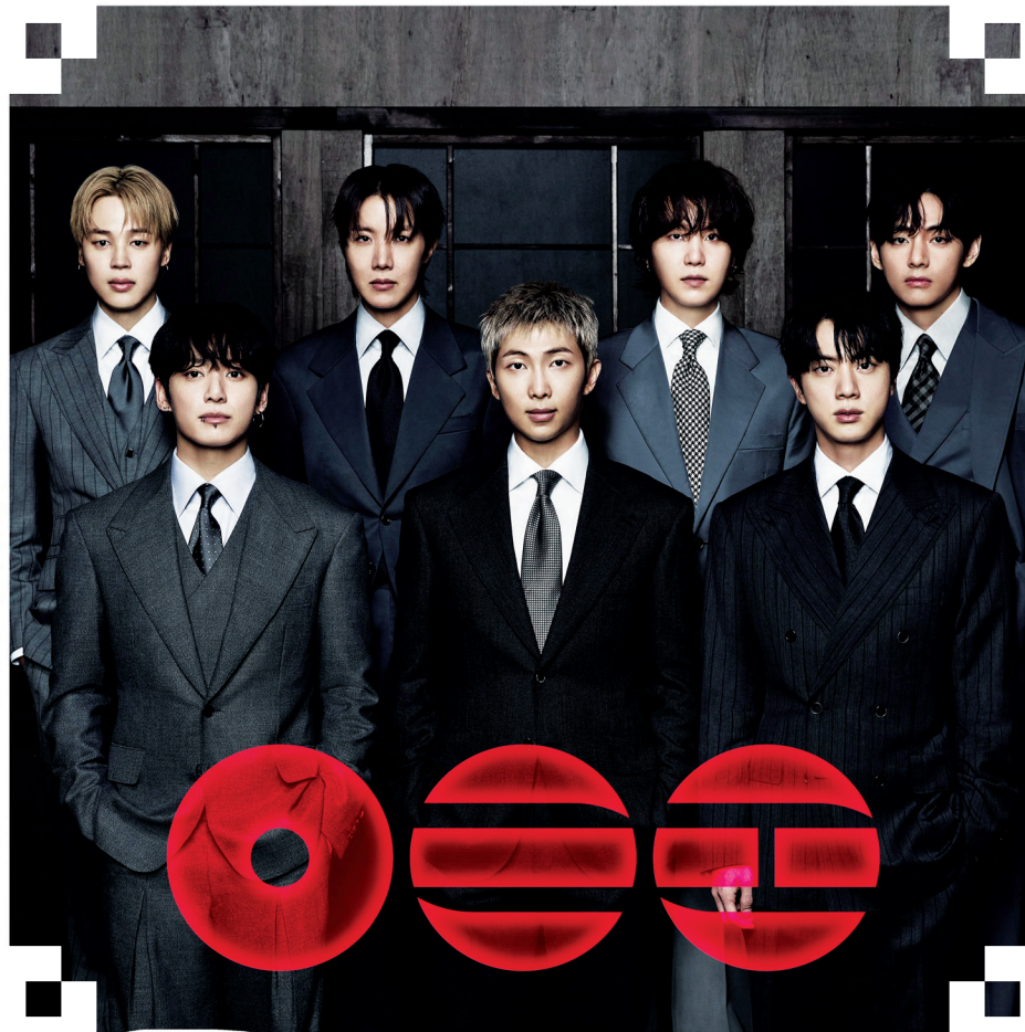
ARIRANG album cover art

The album's genres jump from hip-hop tinged dance tracks to pop ballads with soulful vocals. The first track 'Body to Body' samples the album's namesake. The following tracks, 'Hooligans', 'Aliens', 'Fya' and '2.0' fall into a very similar uncanny valley of brash boy band braggadocio. A single gong sounds during the track 'No. 29' as a sort of break leading into the more emotional and tender side of the album.