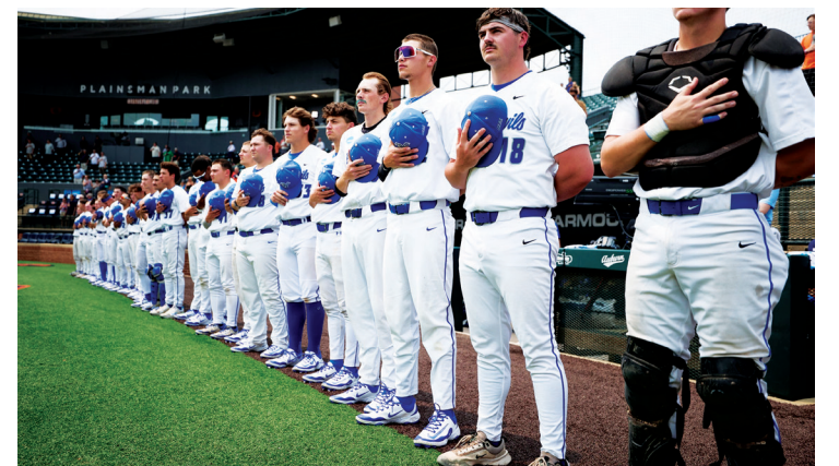
Standing for the national anthem, the baseball team hopes to replicate the same success they had last year, this year,