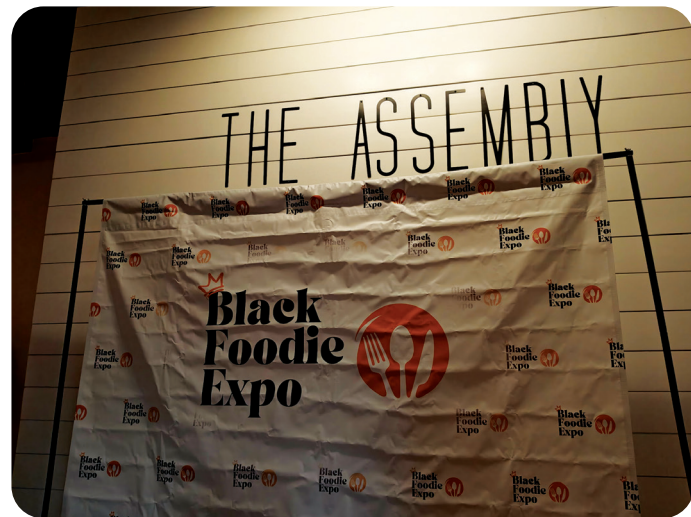
The After Work Social presented by the Black Foodie Expo was held on March 27