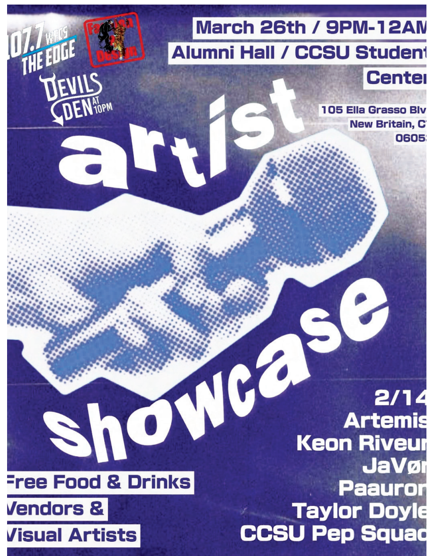
Artemis, D&J Productions.

"This year, particularly, was the best yet," he said. "I've heard so far that there have been plenty of people who were impressed with the event and the scale of it. I want to keep it going and improve even further. While there are always going to be hiccups, overall, that's fine, as long as we get as many heads as possible coming in, looking around and thinking, 'Oh, this is what the radio station on campus is doing for the local scene and for the community.'"