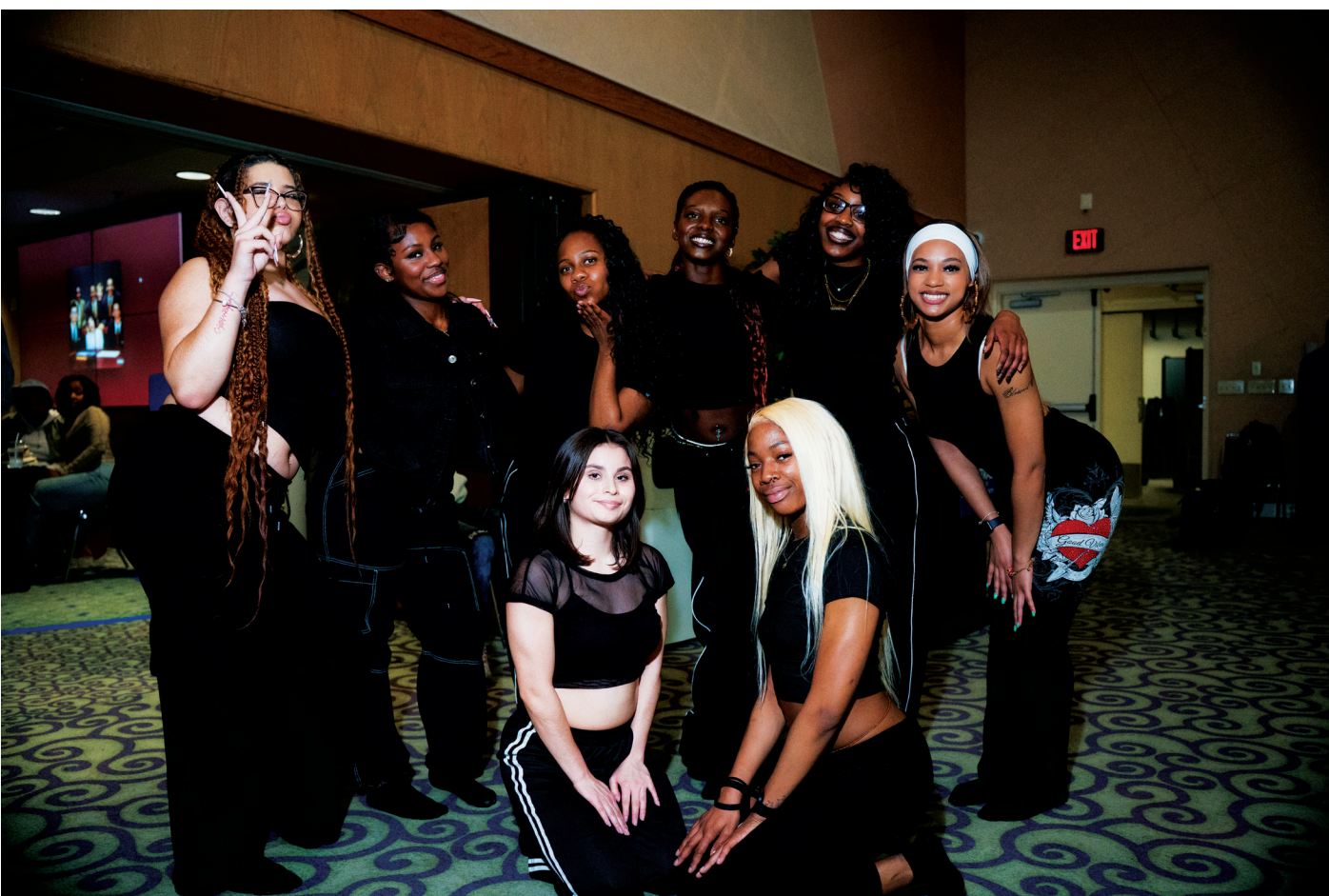
The CCSU Pep Squad, D&J Productions.