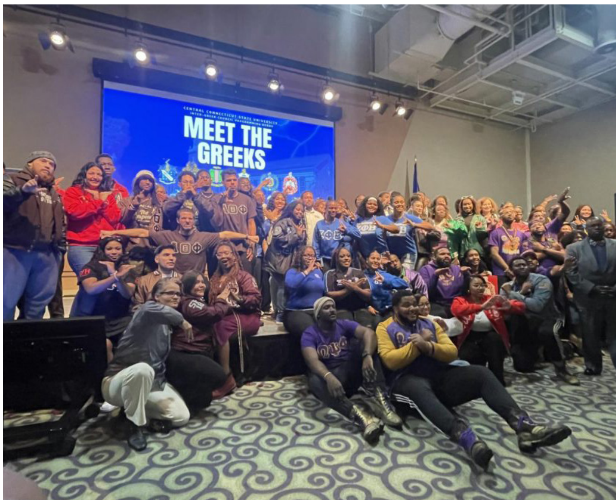
Greek organizations gather to take a group photo at "Meet the Greek