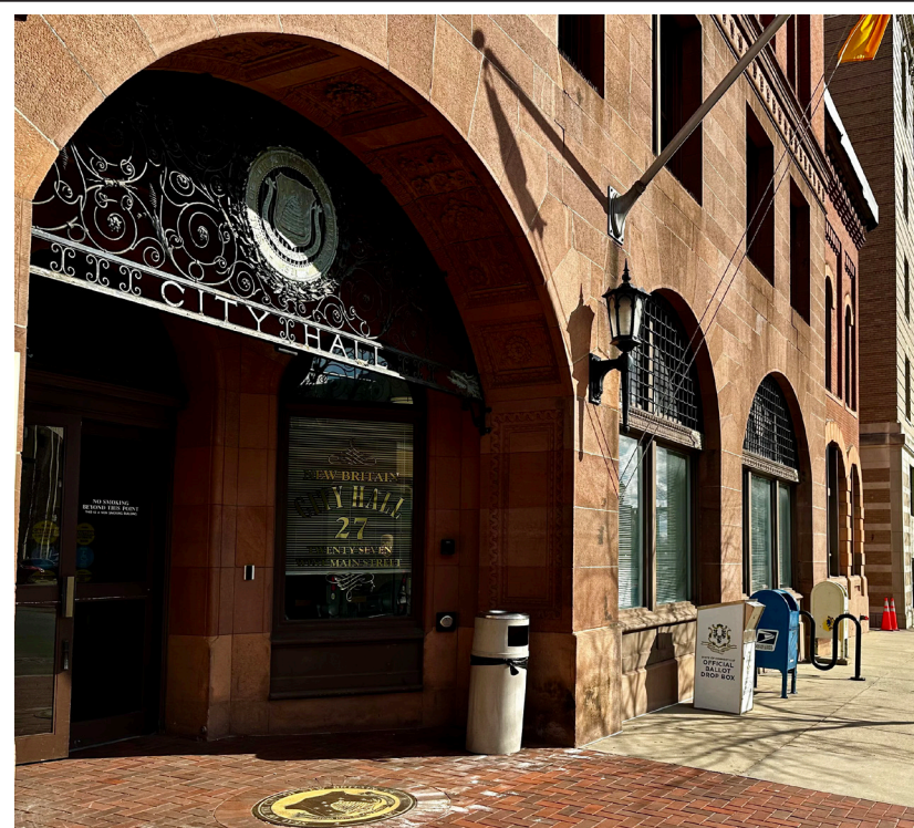
New Britain City Hall