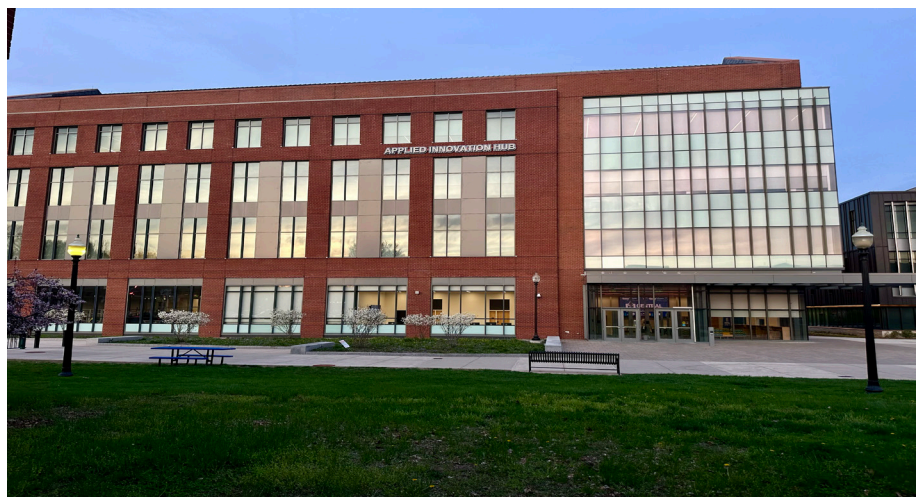
The Applied Innovation Hub has a wide variety of state-of-the-art equipment, from robotics technology to rooms full of 3-D printers

2026 Spring Charity Car Show Sunday, April 19, at 10 AM CCSU Student Center Parking Lot