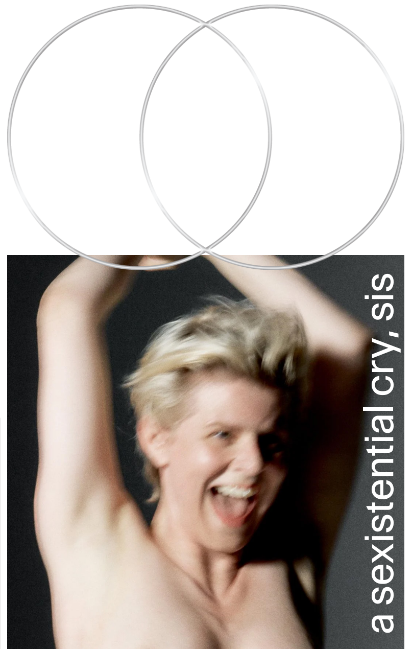
Sexistential album cover, robyn.com