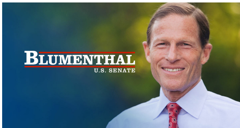
Richard Blumenthal has been a Connecticut Senator for the past 15 years

Blumenthal said he understands the level of apprehension students and families are experiencing amid the uncertainty. “I want Connecticut students and families to know that you are not alone in this uncertainty and frustration,” Blumenthal said. “Your education and financial security are a priority, and I will continue working to make sure federal programs support Connecticut families.”