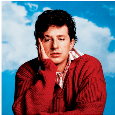
Whatever's Clever! (Standard Edition) [above] (Expanded Edition) [right], charlieputh.com

'Washed Up' is another feel-good harmonious track with notes of Sade's 'Smooth Operator' and Earth, Wind, and Fire's 'That's The Way of the World' reassuring the listener for their help even when they refuse to ask and end up in a worse predicament. 'New Jersey' is a R&B flavored track