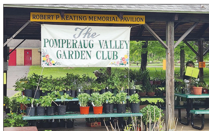
A large variety of plants have been offered at past Pomperaug Valley Garden Club sales. Visit this year's sale on May 16. (Submitted photo)

The sale will include a treasure-filled, garden-themed White Elephant Sale, including unique finds for gardening enthusiasts. Our popular alpaca nesting balls also will be available.