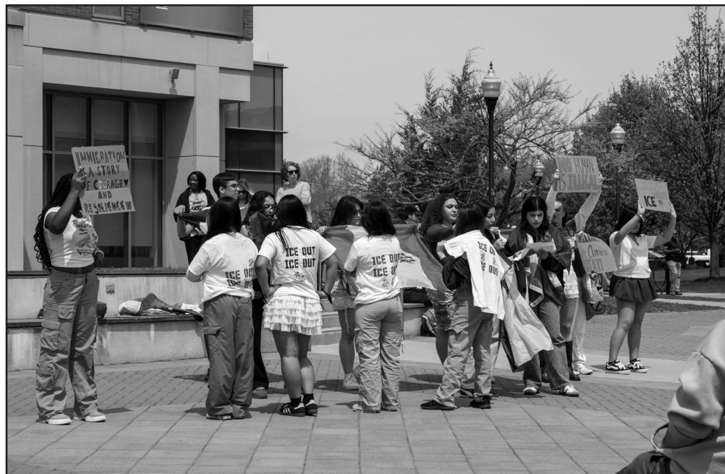
Members of the OLAS dance team gather with signs during their performance.