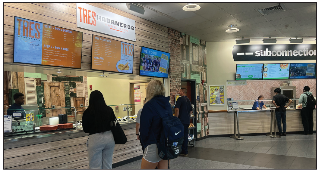
Students wait in line at some of the retail dining destinations, Tres Habaneros and SubConnection, in the Adanti Student Center Food Court on Sept. 15.