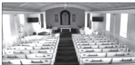
Indoor Worship Service Sunday 10 am