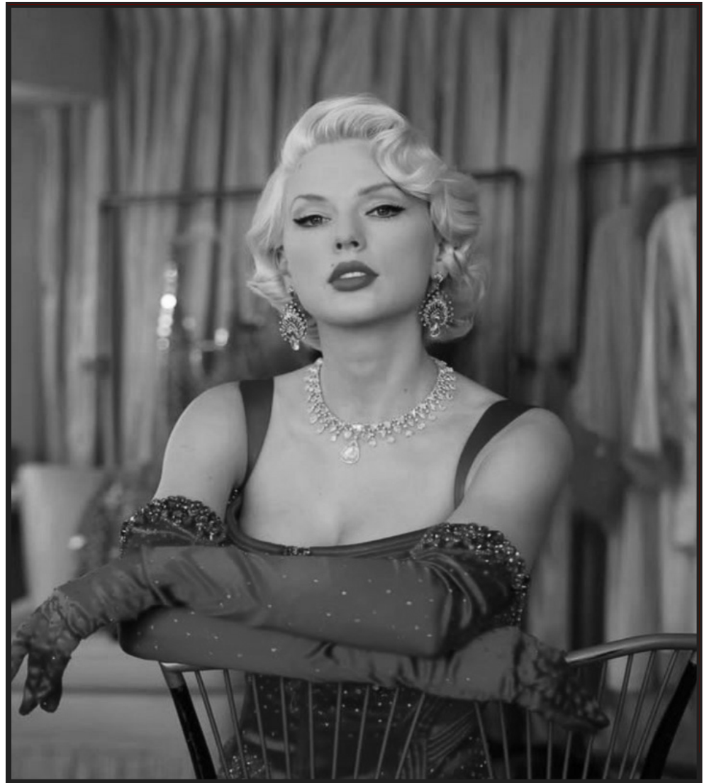
THE LIFE OF A SHOWGIRL

In the final analysis, Westhill seems to have a very high Swiftie population, and it looks like they are with the showgirl performance Taylor Swift has given them with her new album, through promotion, melody, and lyrics.