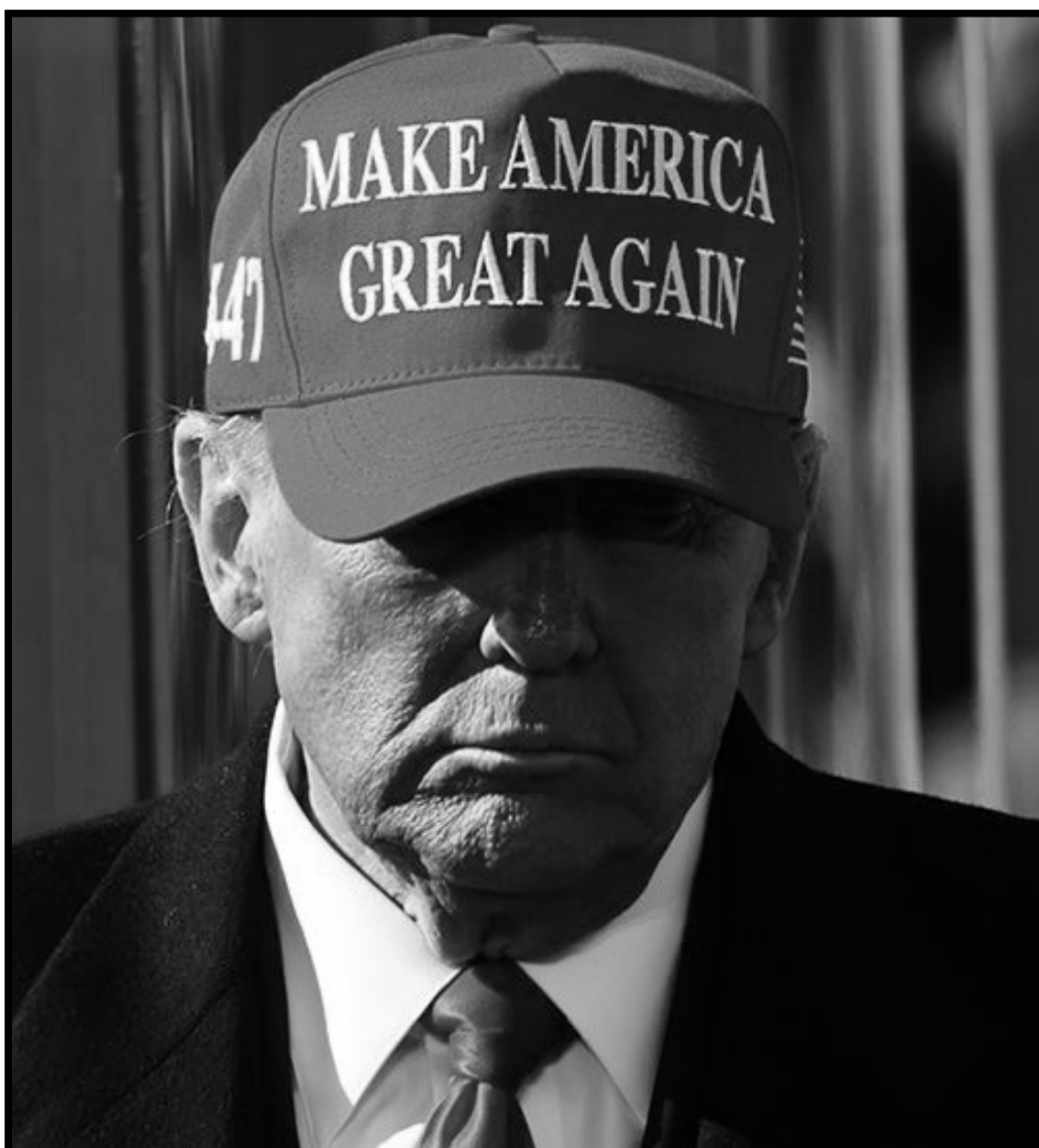
MAGA "Make America Great Again" - Trump's Infamous slogan.