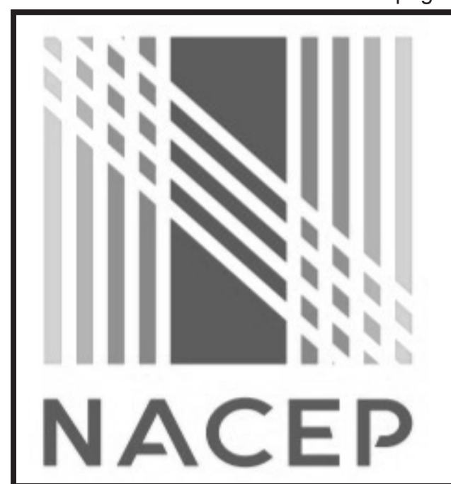
NACEP National Alliance of Concurrent Enrollment Partnerships Certified.