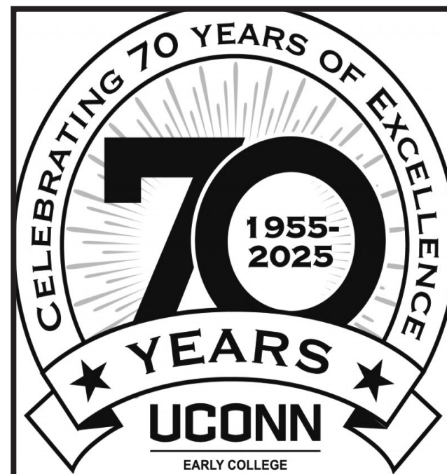
70 YEARS UConn’s Early College Experience has been running.

Overall, UConn ECE courses provide Westhill students with an opportunity to challenge themselves academically while also getting a head start on college. From earning transferable credits to experiencing college-level expectations, these classes prepare students for future success both in and beyond high school. UConn ECE is a valuable option for motivated Westhill students looking to make the most of their education.