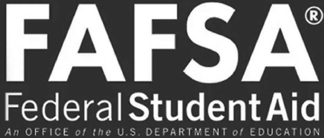
FAFSA Federal Student Aid Logo