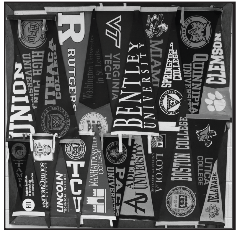
"A WALL OF COLLEGE PRIDE." "

FAFSA might seem daunting, but breaking it into smaller steps makes the process far less confusing. Start early and stay organized. Your future self will thank you.