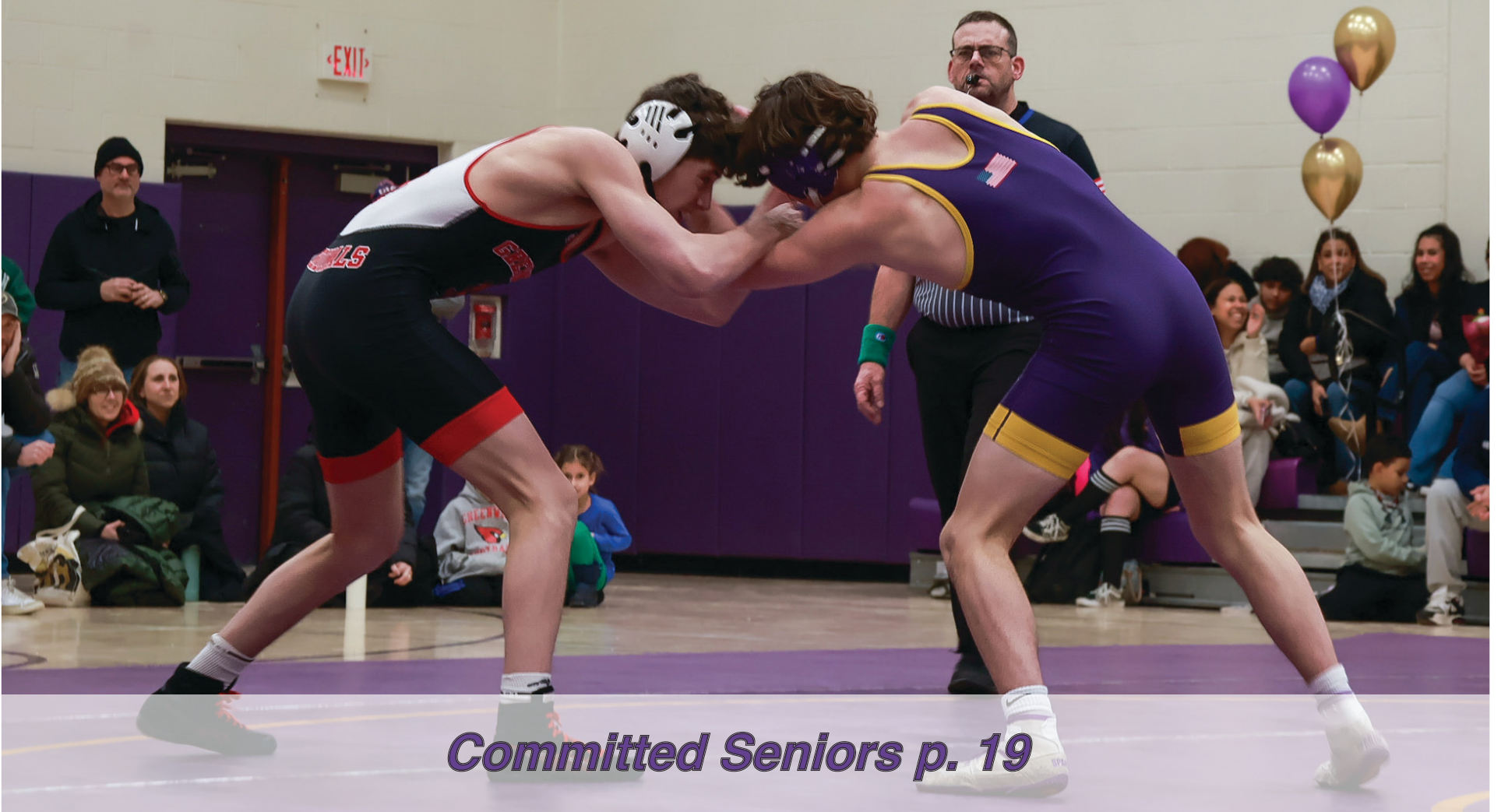
Committed Seniors p. 19

Wuthering Heights Review p. 14 / Pros and Cons of Winter p. 15