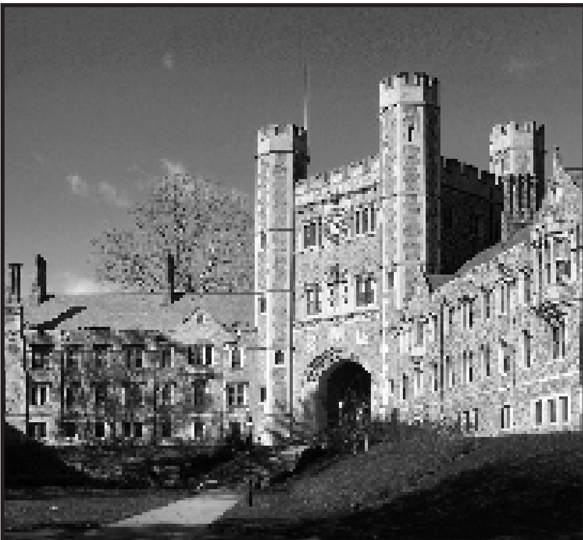
Blair Arch at Princeton University.

Overall, Westhill has had a fairly successful alumni group with several people going to Ivy League institutions in the past few years. Key tips that no one should forget is to: be yourself, highlight your strengths, and never forget to work hard.