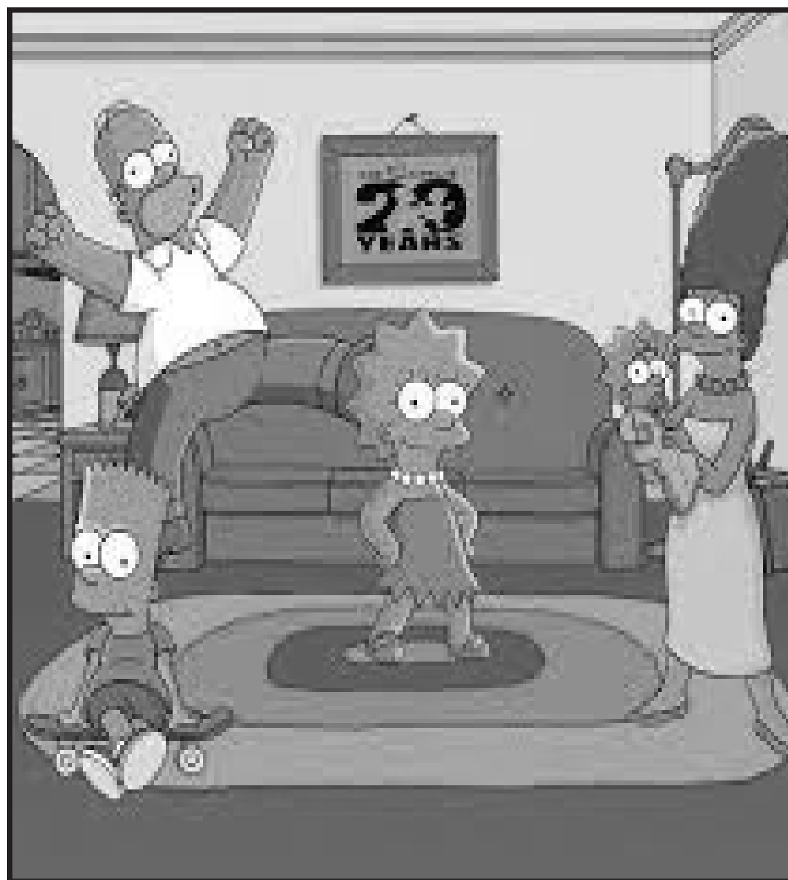
Illustration via Creative Commons