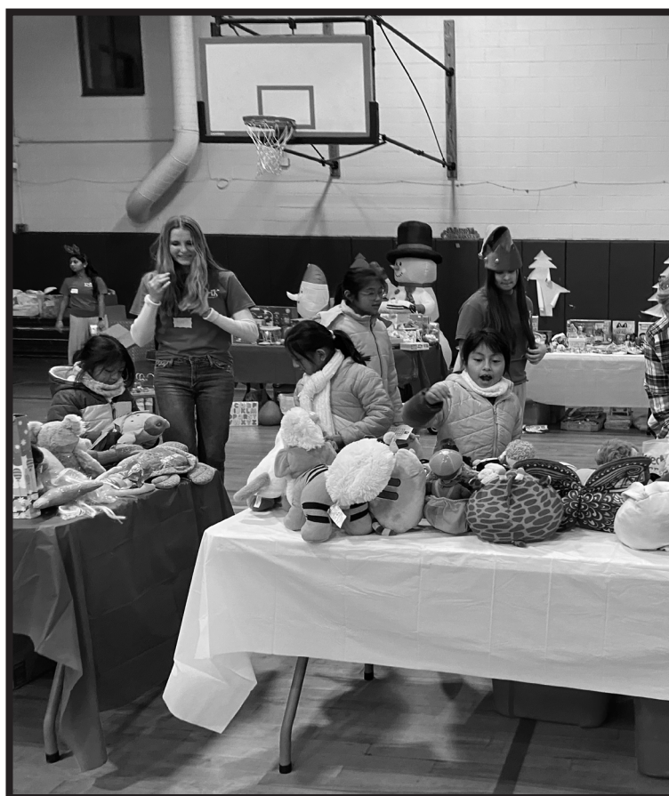
(Far Left) The candy cane and cinnamon sticks add a classic holiday touch. Creative Commons Picture (Above) Volunteers in festive Santa hats spread holiday cheer by preparing gifts and decorations to give back to their community. Creative Commons Picture (Bottom) Kids shopping at the Kids Helping Kids Gift of Giving Event. Photo by Nouha Benhakki ('25)

“Wishing you much cheer this holiday season”