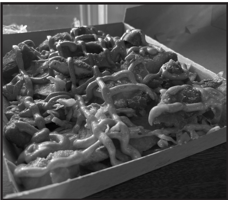
LOADED FRIES are a good bang-for-your-buck menu item.