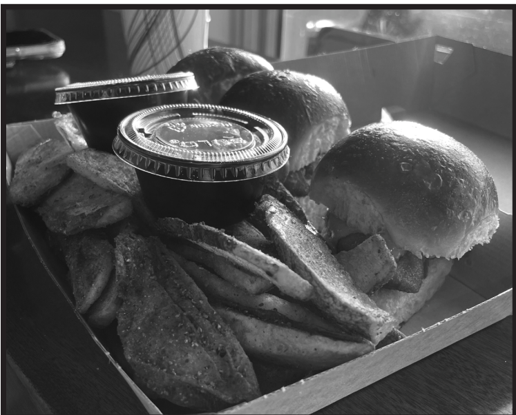
CWISPY SLIDERS WITH FRIES make a great to-go meal.