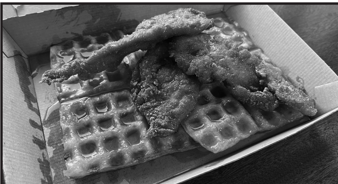
CHKN N' WAFFLES were a hit-or-miss among our team.

Hidden amongst the dealerships and auto shops native to Stamford's East Side is the new, rising-in-popularity, fast food restaurant: Cwispy Chkn.