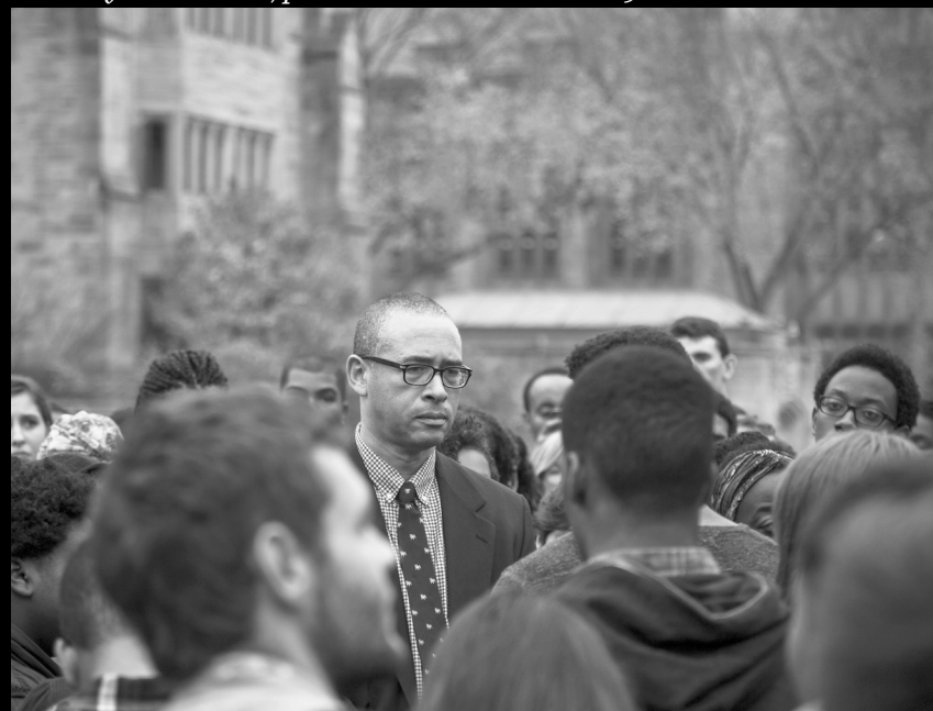
published in the News in 2015